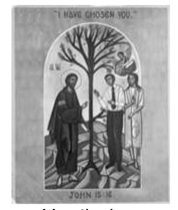
Vocation Icon T oday: Herring Family Next Sunday: Open

We pray that we all will make courageous choices for a simple and environmentally sustainable lifestyle, rejoicing in our young people who are resolutely committed to this.