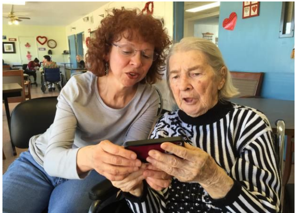
Visit to senior shut-ins

The last day to purchase cards will be Palm Sunday, March 20 th .