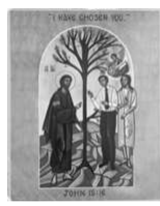
Vocation Icon Today: Gloetzner Family Next Sunday: Talamante Family