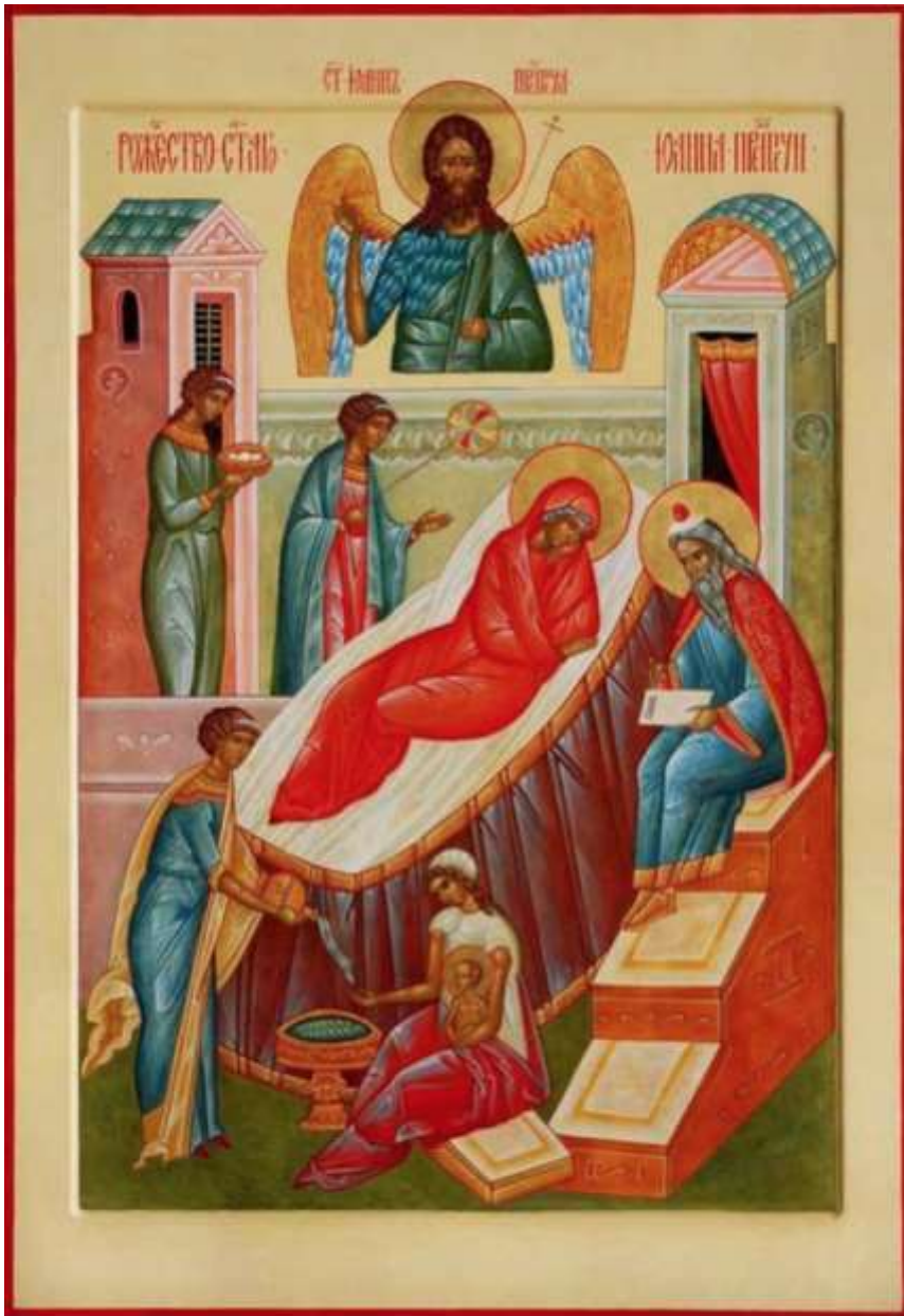
June 24: Nativity of John the Baptist

Today the joy-creating birth of the Forerunner ends the sadness of his father's muteness and the barrenness of his mother. Indeed, his birth heralds the present joy and happiness. Therefore, all creation celebrates in splendor for he reveals the star of Christ, the Orient from on high and the Passover of all the faithful. (From the Festal Matins)