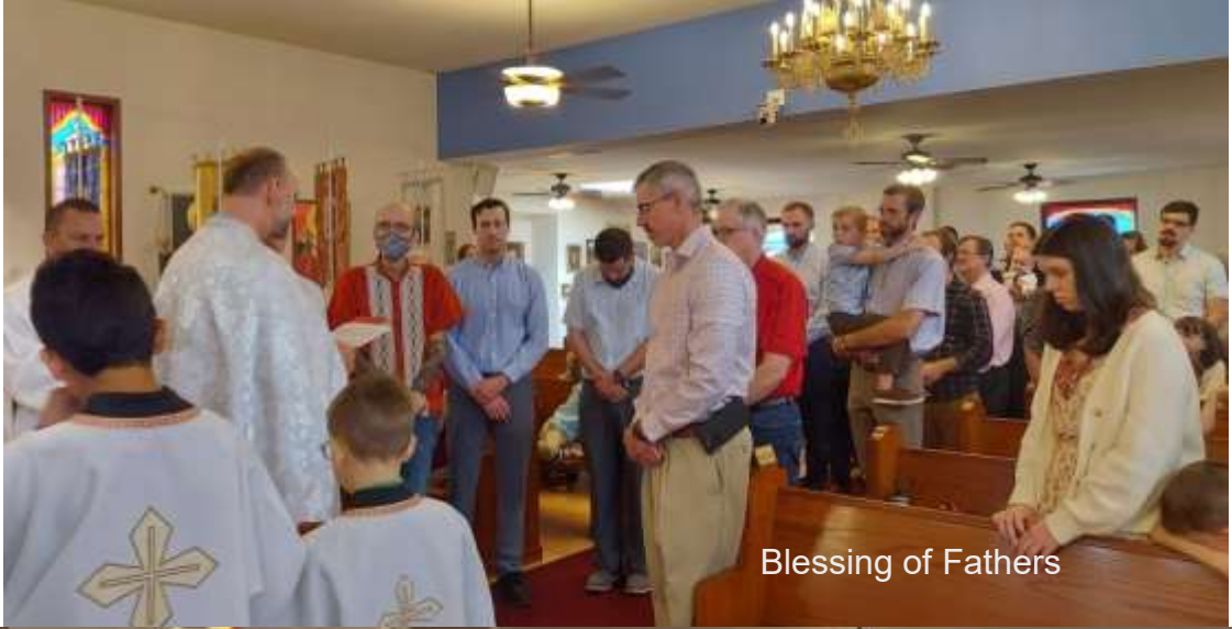
Blessing of Fathers